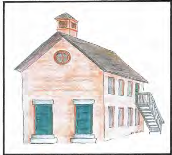
Artist's conception of original configuration of the Mount Vernon School circa 1860.

By 1899 Chatham Township had achieved its present size due to the succession of Madison and Chatham Boroughs as well as Florham Park. Its population was 620. The one room was proving too small to educate the growing number of children. Around 1902-1904 the current vestibule and cloak room with interior stairs to the second floor was added to the front of the building. This eliminated one of the original entrance doors and opened up the second floor to be the classroom for the fourth through eighth grades. The Mount Vernon Sunday School also continued to flourish. These educational and religious functions distinguished the Red Brick Schoolhouse as a lively community center with winter plays, Christmas services, and other events.